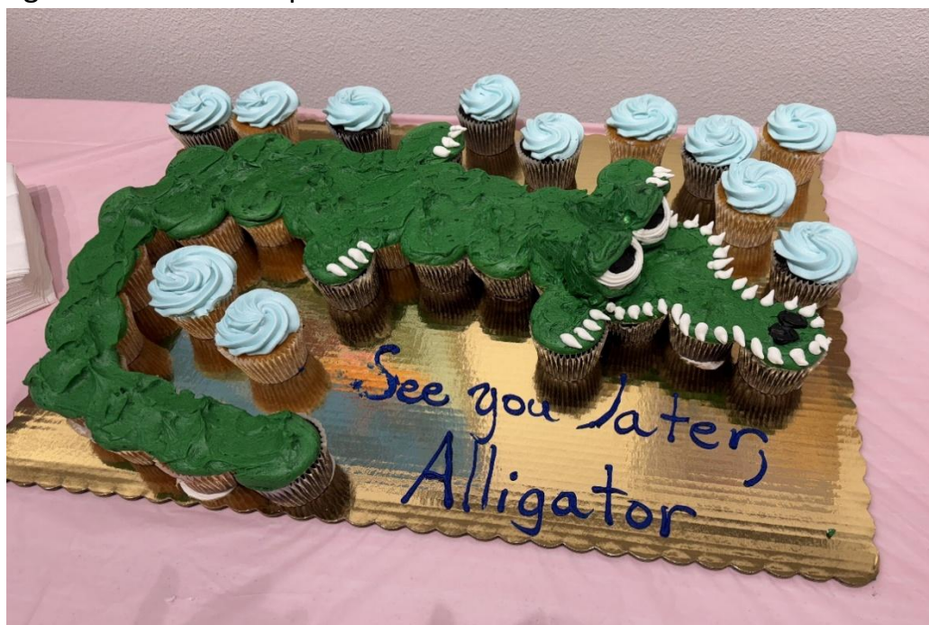
Birmingham Farewell and photos