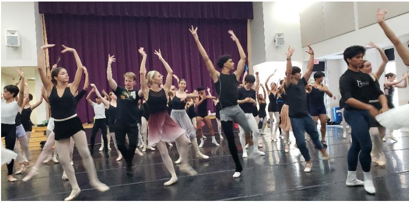
Cuban ballet, thanks to Reeta for sharing the invite to our club.